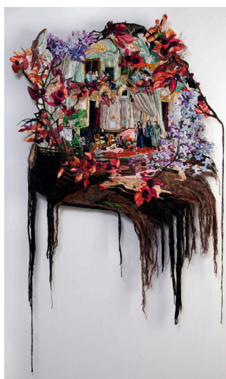
Sophia Narrett, The Serious Side of Three Dreams, 2014

Sophia Narrett (USA) trained at the Rhode Island School of Design in the painting programme. Besides coloristic paintings Sophia Narrett also creates sophisticated embroideries. In a comprehensive process where Narrett 'paints' her pictures with coloured thread, she conjures up dreamlike scenes that draw inspiration as much from the motivic depths of art history as from the everyday social culture of the present.